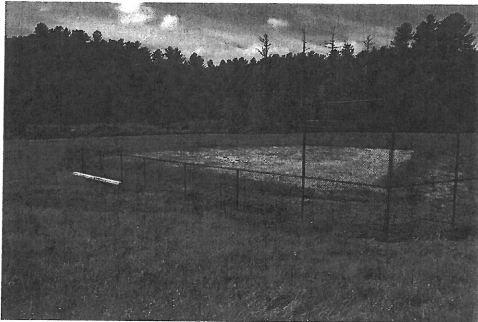
Ann Lees ballfield - September, 2019