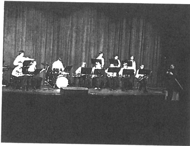
The First Middle School Jazz Band Performance