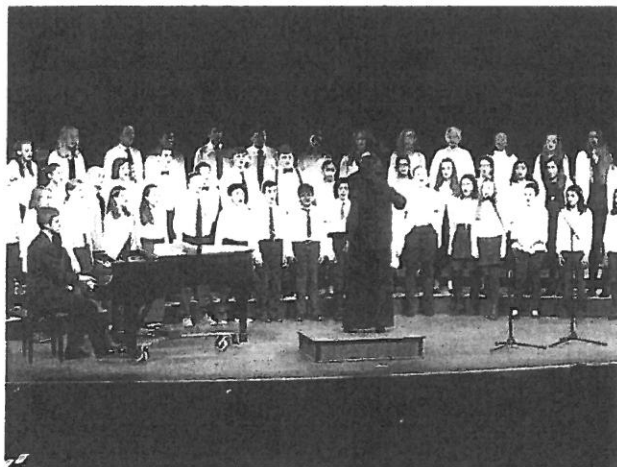
The 7th and 8th Grade Chorus