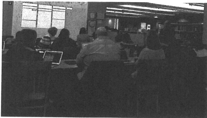
Figure 2: Teachers Participating in Tech Training